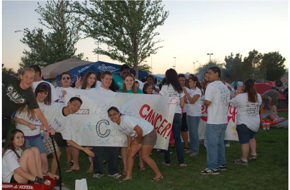
People who attended the 12 hr Relay for Life for Cancer, from 7pm - 7am

Rancho HOSA sponsored nine teams for the Relay for Life Cancer Event on Friday, May 8, 2009. Over 90 HOSA and Medical Magnet students participated in the event. Each team raised an average of $150-300 selling ribbons, having cupcake walks and booths at the event. The total amount donated was $1485. Students participated from 7PM - 7AM walking around the track in honor of all cancer victims and survivors. Everyone was invited to buy a luminaria and light it in honor of a family member who died of cancer. This was a real bonding time and 12 hours of fun with games, races, and building pyramids. Students are really psyched for next years' "Relay for Life" event .